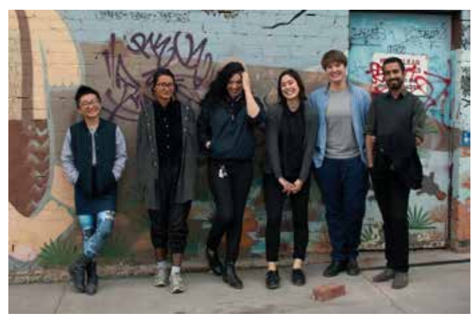
Queering the Air program team