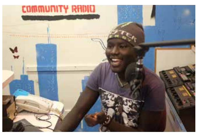
Particpants from the Yarra Youth Training