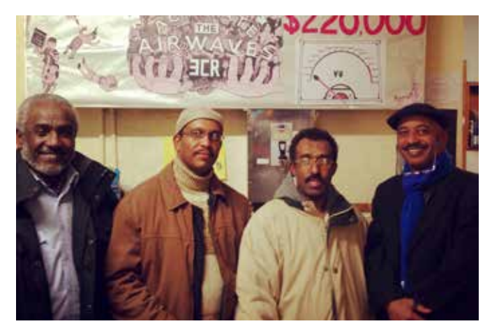
The Eritrean program team