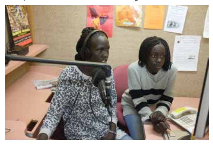
Particpants from the Yarra Youth Training