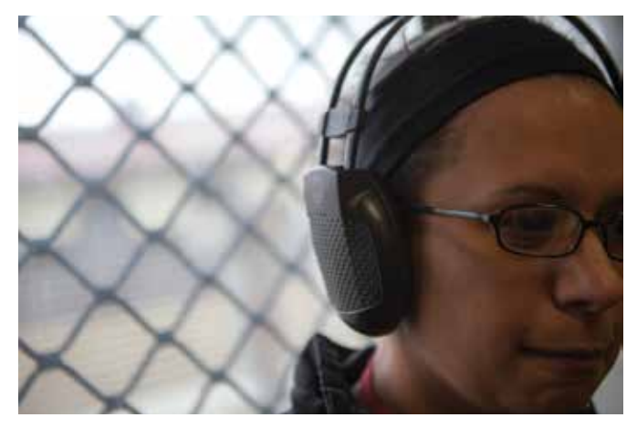
Beyond the Bars 2015