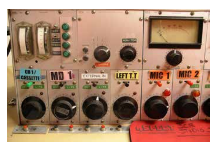
The panel in studio one

General instrucitional videos, for example, how to use the telephone in Studio 2.