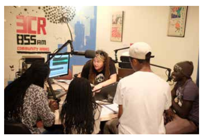
Particpants from the Yarra Youth Training