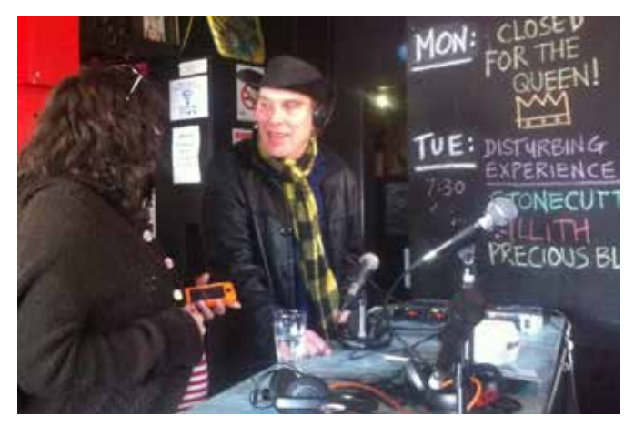
Burning Vinyl LIVE from the Public Bar

Ancestors Echo Diffused Frequency Feminist Focus Indearts Turkish Women's Show