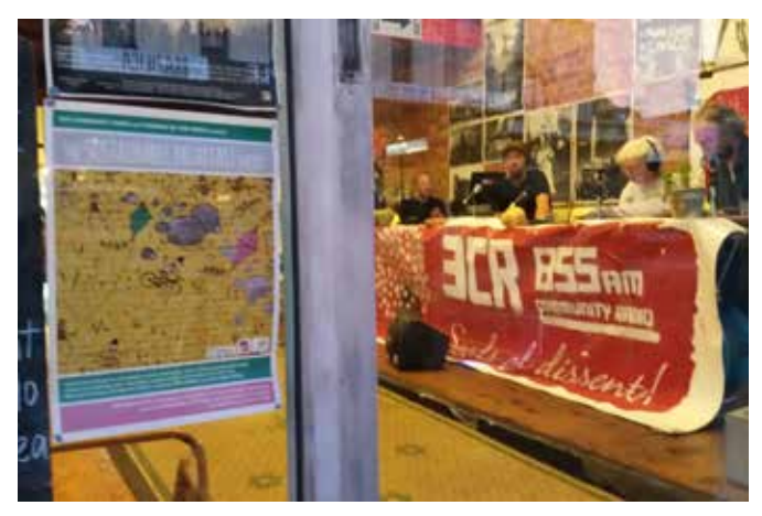
Sustainable breakfast broadcast from Friends of the Earth