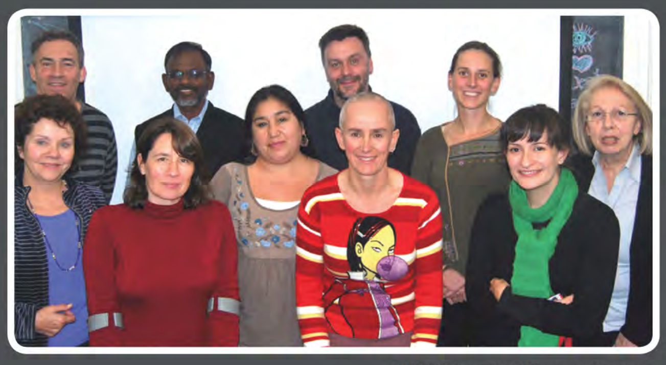
2012 3CR Committee of Management members