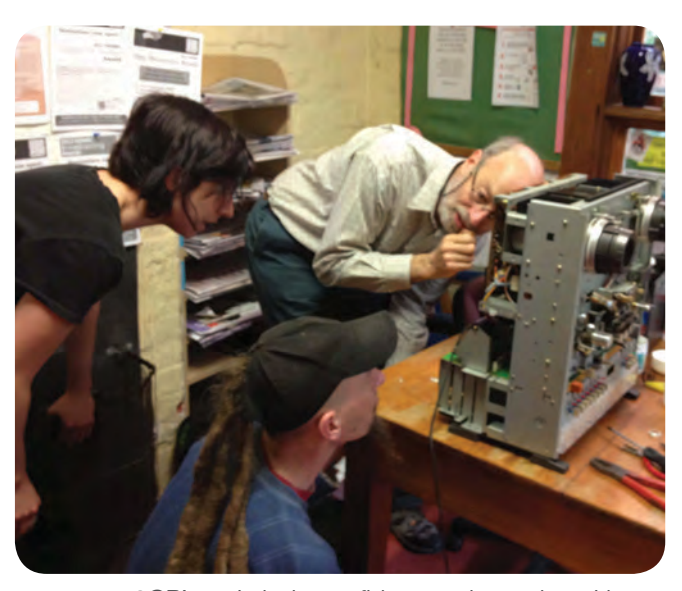
3CR's technical team fixing a reel to reel machine