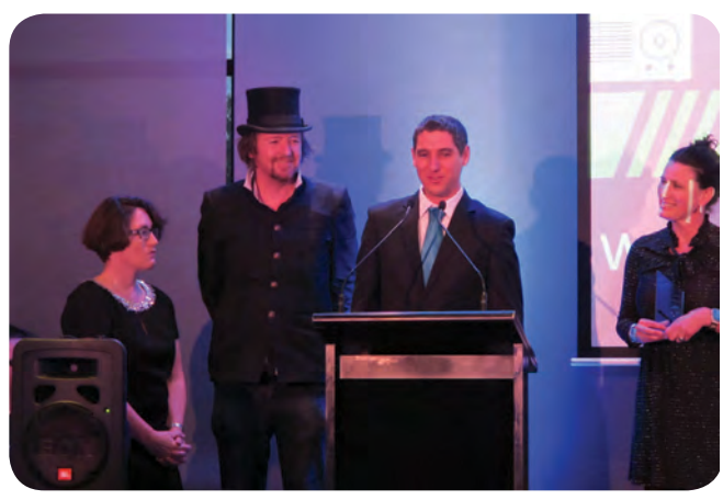
Brainwaves team members accept 3CR's CBAA award for excellence in training

"I found the training worthwhile and rewarding. The training team were very professional and indeed inspirational."