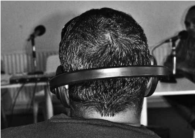
Beyond the Bars broadcast.