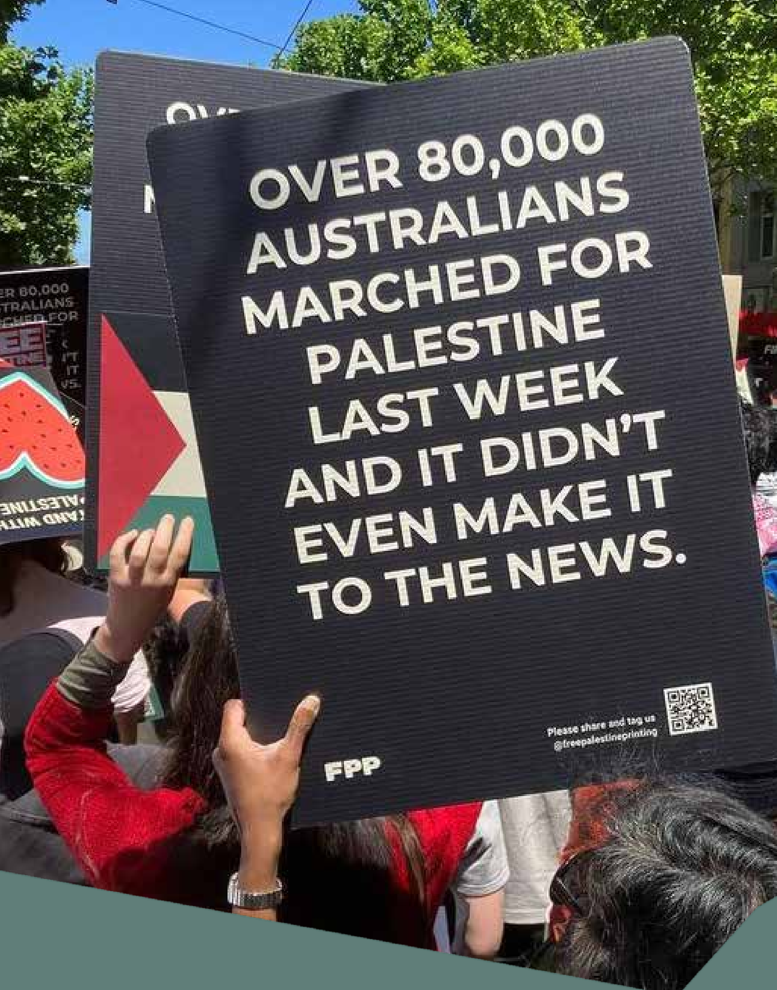
Above: Free Palestine Printing placard at the weekly Free Palestine Melbourne rally