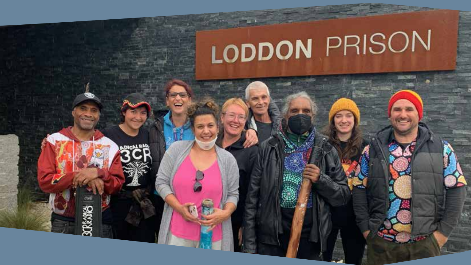
Top: Broadcast team PX Whanau , 3CR techs and guests at the Pride Street Party outside broadcast Below: Beyond the Bars Loddon Prison broadcast team