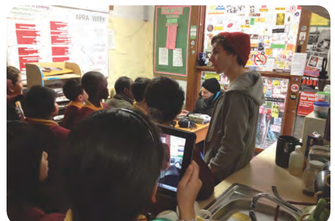
3CR Station tour