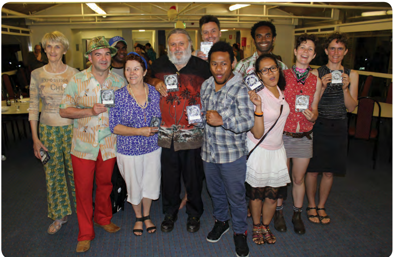
Some of the 3CR radio awards winners, 2012