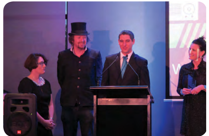
Brainwaves team members accept 3CR's CBAA award for excellence in training

“I found the training worthwhile and rewarding. The training team were very professional and indeed inspirational.”