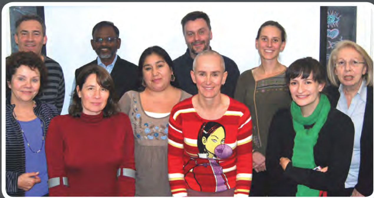
2012 3CR Committee of Management members

AMWU AMIDA Anarchist Media Institute Arada Ethiopian Cultural Centre Inc Armenian Gen. Benevolent Union Aust Saay Harari Association Inc Australia Asia Worker Links Australian Arabic Women's Foundation (AAWF Inc) Australian Chin Community Eastern Melbourne Australian Panjabi Prosperity Association Beyond Zero Emissions Buoyancy Foundation CEPU Electrical Division CEPU Plumbing Division Ceylon Tamil Association Vic CFMEU Construction & General Div Chilean Australian Friendship Society CICD Connolly Association Council for the DOGS EarthSharing Australia Ethiopian Community Association Federation of Community Legal Centres Friends of the Earth Grit Media Hararian Community Association of Aust Hepatitis C Council of Victoria Housing for the Aged Action Group Latin American Info Centre LICAU_SED Inc Melbourne Unitarian Church Mental Illness Fellowship MUA National Union of Workers Ogaden Community of Australia Roominations Save Albert Park Somaliland Society of Australia Inc SUWA Tenants Union of Victoria Ltd The Boite Vic Branch Sec SPA Victorian Jazz Club Victorian Labour College