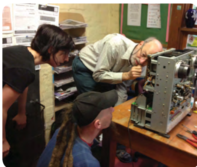
3CR's technical team fixing a reel to reel machine