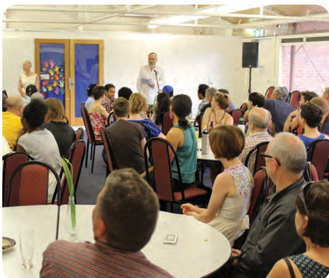
3CR radio awards night, 2012