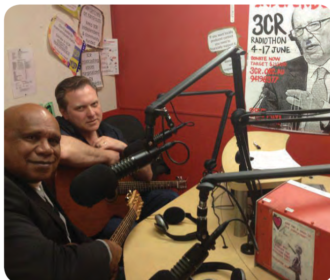
Archie Roach live in studio one