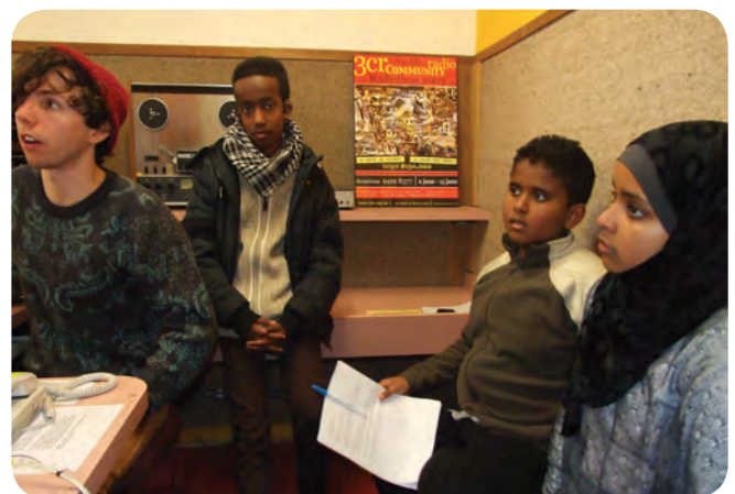
Eritrean Voices special training